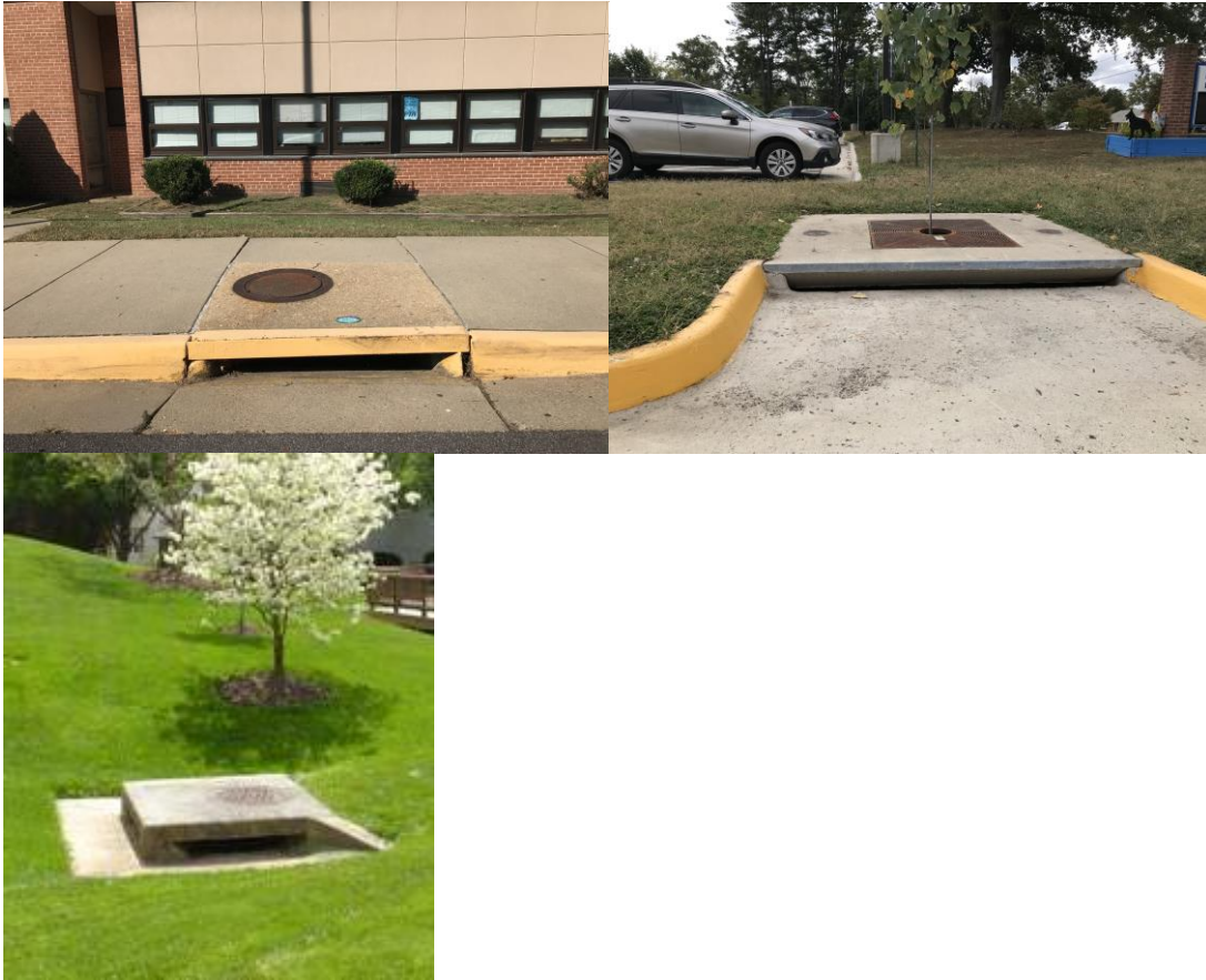
Top row: examples of curb inlets. The curb inlet on the right with tree planter facility is eligible for artwork with added consideration placed on the tree's health. Bottom row: examples of a yard inlet. These are the two most common types of storm drains on FCPS campuses that can be painted.